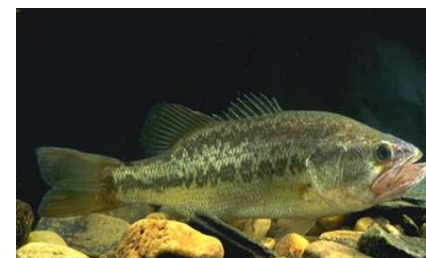
Largemouth bass are among numerous predators that feed on sailfin mollies.

Reproduction: Female sailfin mollies tend to be larger than males, a disparity typical of the Poeciliidae. Males exhibit large and colorful dorsal fins in addition to a colorful caudal fin and these conspicuous secondary sexual features play a role in female mate choice. Fertilization is internal and is accomplished by means of highly modified fin elements within the anal fin of males that form a structure known as the gonopodium. Sailfin mollies produce broods of 10-140 live young, depending upon maturity and size, and females may store sperm long after the demise of their relatively short-lived mates. The gestation period for this species is approximately 3-4 weeks, depending upon temperature, and a single female may give birth on multiple occasions throughout the year. Although sex ratios of the broods are balanced, adult populations tend to be largely female as males appear to suffer higher rates of mortality due to a greater susceptibility to predators and disease as a consequence of their showy breeding dress and a life spent largely in a frenzy of breeding. There is no parental care exhibited by this species.