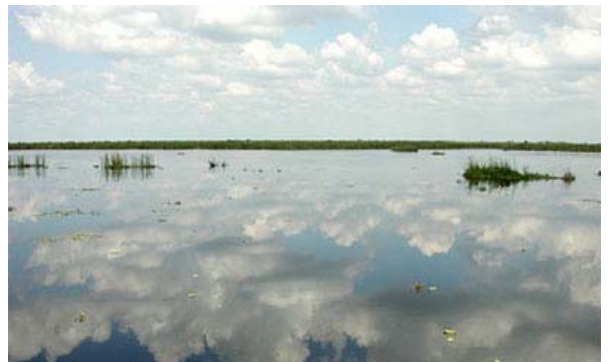
Freshwater marshes provide habitat for sailfin mollies.

Distinctive Features: The body of the sailfin molly is essentially oblong. The head is small and dorsally flattened, with a small, upturned mouth. The caudal peduncle is broad and the caudal fin is large, rounded, and sometimes tipped with black. The pelvic fins originate at a point anterior to the dorsal fin. The dorsal fin is greatly enlarged in mature males and somewhat enlarged in females. It is this conspicuous and attractive feature that lends the species its prevailing common name.